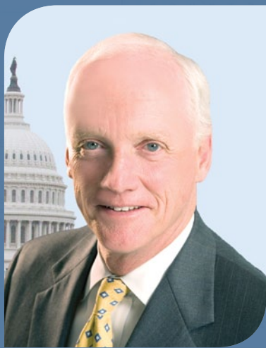
Frank Keating TRUST Board Member