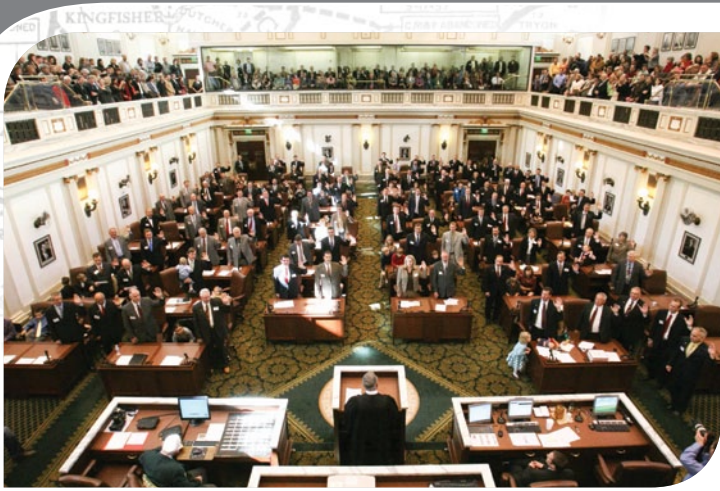
From page 2...

Because SQ 744 does not identify a revenue source to fund the tax increase, state lawmakers in charge of budgeting are grappling with possible scenarios to pay for the mandate.