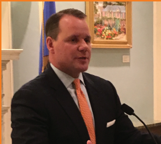
Lt. Governor Todd Lamb addresses the audience during TRUST Transportation Day at the Capitol.