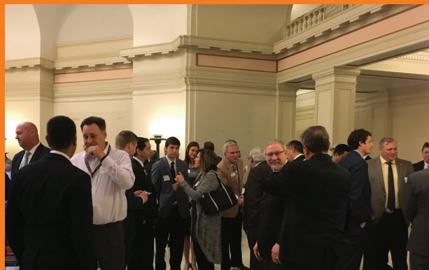
TRUST members and legislators visit prior to lunch at TRUST Transportation Day at the Capitol.