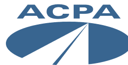
OKLAHOMA / ARKANSAS CHAPTER