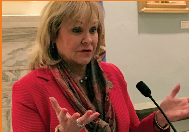
Governor Mary Fallin makes a point while speaking at TRUST Transportation Day at the Capitol.