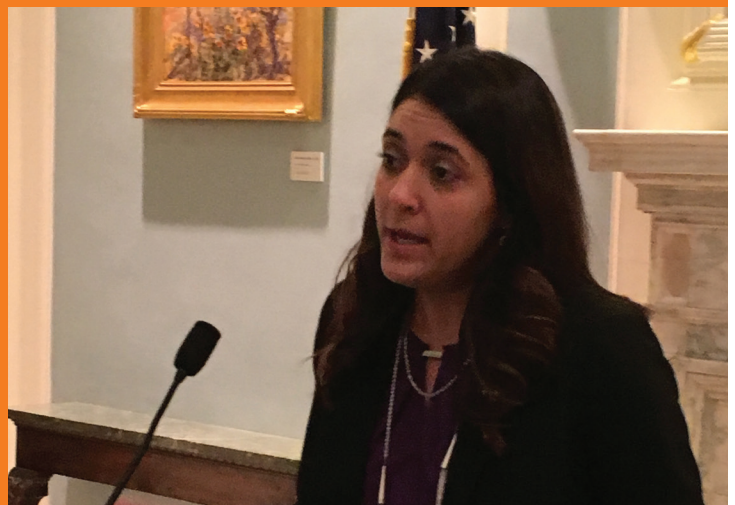
Senator Stephanie Bice, Senate General Government & Transportation Chair, speaks during TRUST Transportation Day at the Capitol.