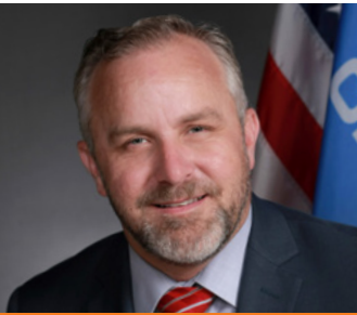
Senate President Pro Tempore Greg Treat