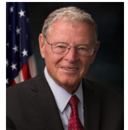
U.S. Senator Jim Inhofe

U.S. House despite Republicans drastically reducing the margin. One contributing race was Oklahoma's Fifth Congressional District, which was perhaps the most hotly contested congressional election in the country. In the end, Republican state Senator Stephanie Bice narrowly defeated incumbent Democrat Rep. Kendra Horn with 52% of the vote. Each of Oklahoma's other four Republican incumbent U.S. Representatives (Kevin Hern – CD 1, Markwayne Mullin – CD 2, Frank Lucas – CD 3, Tom Cole – CD 4) handily won re-election. In the