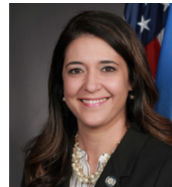
Representative-elect Stephanie Bice

U.S. House despite Republicans drastically reducing the margin. One contributing race was Oklahoma's Fifth Congressional District, which was perhaps the most hotly contested congressional election in the country. In the end, Republican state Senator Stephanie Bice narrowly defeated incumbent Democrat Rep. Kendra Horn with 52% of the vote. Each of Oklahoma's other four Republican incumbent U.S. Representatives (Kevin Hern – CD 1, Markwayne Mullin – CD 2, Frank Lucas – CD 3, Tom Cole – CD 4) handily won re-election. In the