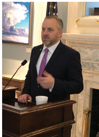
Senate President Pro Tempore Greg Treat makes a point while addressing the audience at TRUST Transportation Day at the Capitol.