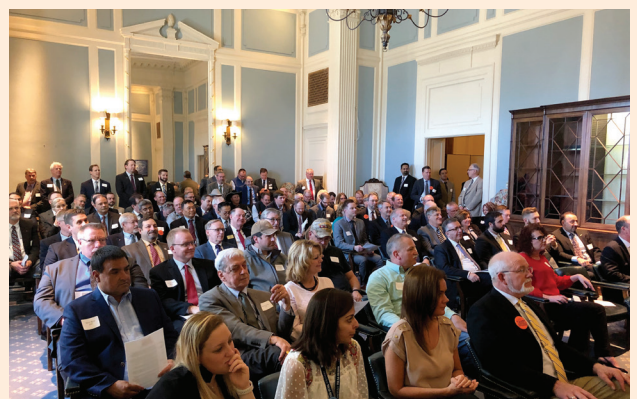
An overflow crowd gathers in the Blue Room for the TRUST Transportation Day at the Capitol program.

Within the federal government, Oklahoma is extremely fortunate to have a congressional delegation solidly committed to supporting and rebuilding America's transportation network. Senator Jim Inhofe, ranking majority member of the Senate Environment & Public Works Committee, has been a tremendous transportation champion throughout his tenure, and Senator James Lankford has provided a reliably strong transportation voice as well. Oklahoma's House delegation can also be counted on to provide steady support for investing in America's and Oklahoma's surface transportation infrastructure. Thank you to each member of our congressional delegation. ■