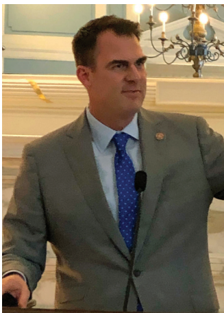
Governor Kevin Stitt was the featured speaker during TRUST Transportation Day at the Capitol.