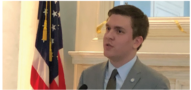
House Transportation Committee Chairman Avery Frix was one of four House leaders to attend TRUST Transportation Day at the Capitol.

TRUST hosts annual Senate & House Transportation Committee dinners each spring. The events are designed for TRUST members and transportation industry advocates to interact with transportation committee members, hear remarks from state transportation officials and updates from legislative leaders on budget negotiations and transportation-related legislation.