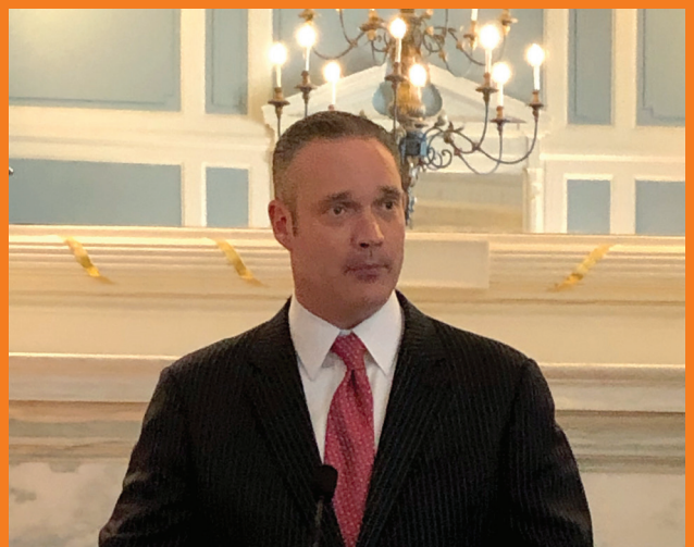
Speaker of the House Charles McCall speaks at TRUST Transportation Day at the Capitol.