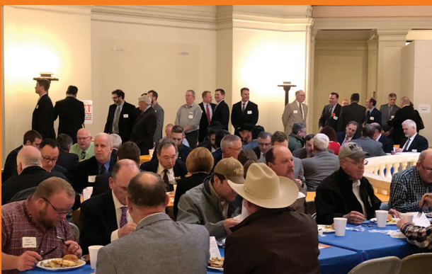
Legislators, TRUST members and transportation advocates filled the 2nd floor state Capitol rotunda for the annual Transportation Day luncheon.

Includes logo placement at forum and admission for two (2). For TRUST members at the TRUSTee, Road Champion, Advocate or Friend level, sponsorship and admission is included. Additional admissions are $50. ■